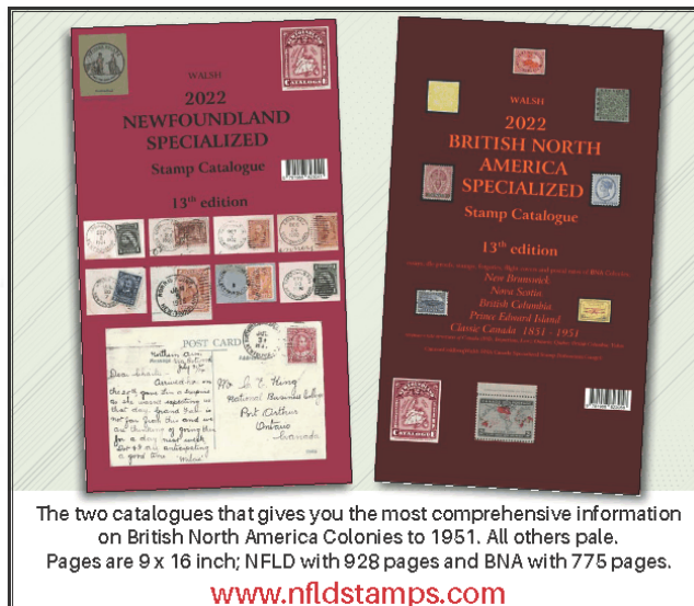
The two catalogues that gives you the most comprehensive information on British North America Colonies to 1951. All others pale. Pages are 9 x 16 inch; NFLD with 928 pages and BNA with 775 pages.

The Walsh 2022 Newfoundland Specialized Stamp Catalogue is available from Walsh's Philatelic Services , nfldstamps.com . Volume one is available for $75 US and volume two for $25 US (plus GST, applied at checkout).