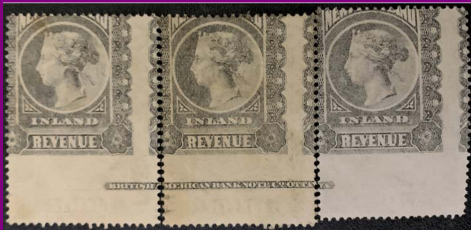
NSSC R 5 verso mirror