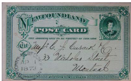
First Day Use; message side confirms date