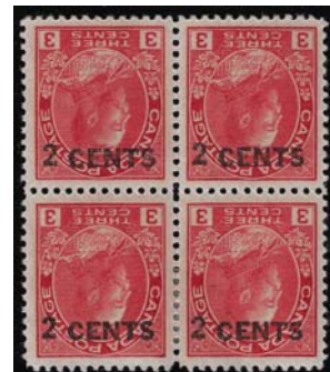
Genuine in all respects